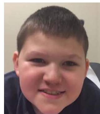
FIGURE 2 Frontal view of child in Family 2 showing the facial features characteristic of Angelman syndrome, including prominent cheekbones, thin vermilion of the upper lip, and prognathism [Color figure can be viewed at wileyonlinelibrary.com]

The only reportable variant detected by clinical testing for a panel of genes associated with syndromic and non-syndromic autism in the child from Family 2 was the same UBE3A variant: c.2T > C (p.Met1Thr) [GenBank transcript: NM_130838.1]. Testing of both parents did not detect this variant, therefore, this variant was apparently de novo in this child. The possibility of germline mosaicism for this variant in either parent could not be excluded. No suitable polymorphic markers were identified in the genomic region around this variant to determine whether the variant was on the paternal or maternal allele. However,